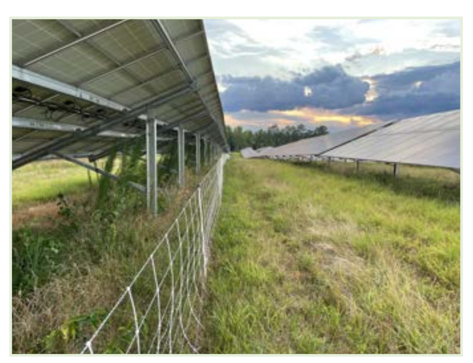
Comparison of sheep grazed (right) vs. non-grazed (left) on vegetation management.

Other management practices traditionally used for parasite control may not be practical in solar grazing systems. It is not realistic to attempt establishment of tannin-containing forages such as <u>Sericea lespede-</u> <u>za</u> or Birdsfoot trefoil and <u>supplemental feeding</u> may be challenging. Protein tubes may be provided in some scenarios. In other cases, limit feeders may be used to provide protein supplementation to ewes and/or lambs while grazing. This requires additional infrastructure to move and refill which may be possible in some solar farms and not in others. Routine handling for FAMACHA© scoring, Five Point